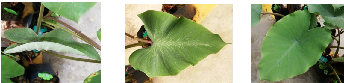
Figure 3: Different forms of C. esculenta leaves after irradiation. From left to right: wrinkled (268.28 Gy, Ring 2), variegated (120.12 Gy, Ring 3) and normal leaves (0 Gy, control)

Most changes observed on leaves of irradiated C. esculenta L. were wrinkle and variegation. Variegation of leaves is a phenomenon in which there is different coloured zones appearance in the leaves, and sometimes also occurs on the stem (Wang et al., 2004). Variegation occurs if there is a lack of chloroplast on the leaves or if chloroplast DNA is damaged and cannot formed chlorophyll (Fadli et al., 2018). As the irradiated plants being exposed to the physical mutagen, the ionizing energy will cause damage to the chloroplasts in the plant cells of the irradiated plant leaves, unabling the chloroplasts to produce chlorophyll. This results in the variegation of leaves. Therefore, increasing the dosage of irradiation will also increase the frequency of variegated leaf formation (Figure 3).